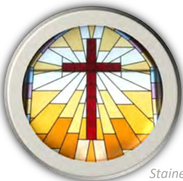
Stained glass window from St Mark's Anglican Church, High Prairie, Alberta.